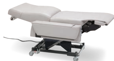
IOA Exam Chair Motorized vertical lift

IOA is committed to providing solutions that improve healthcare spaces. We listen to our customers in order to design, develop and engineer innovations that meet unfulfilled needs while inspiring great Design.