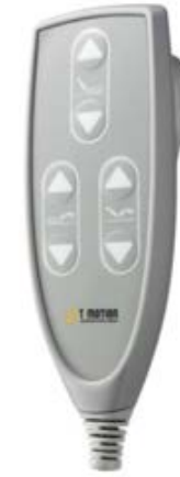
hand and foot controls