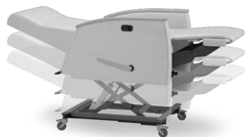
Connect II Hydraulic vertical lift