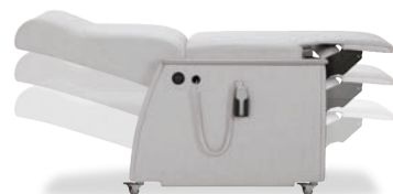
Connect I Motorized vertical lift

Having ten years experience of refining exam chairs, the spectrum is the latest and greatest addition to our exam chair collection. From manual hydraulic to motorized vertical lift, we have the options that meet the needs of each facility.