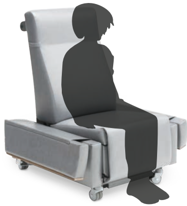
ADA 18.5" seat height