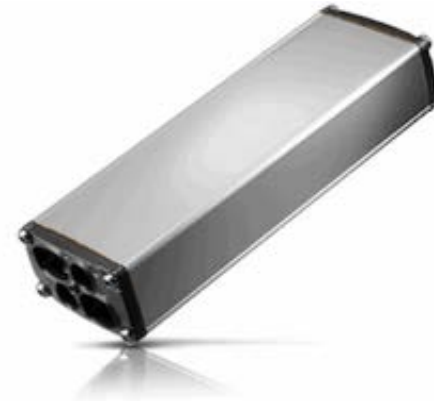
Battery with audible level indicator