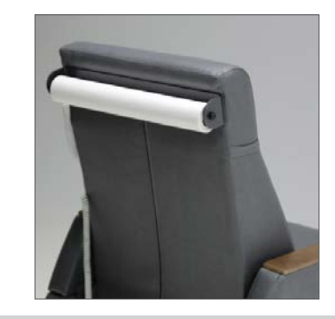
Paper Roll holder

The heated seat and lumbar provides therapeutic warmth and eliminates the need of warming blankets. The optional massaging action provides three variations: wave, pulsating, and vibrating.