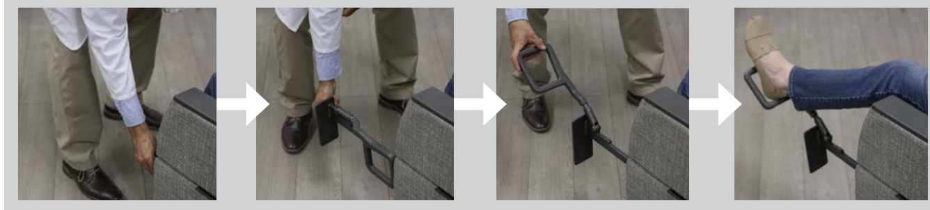
Pull out stirrups

Stirrups are stored in the arm of the recliner until needed. Simply pull out the stirrup, lift and turn into place and adjust to the appropriate distance