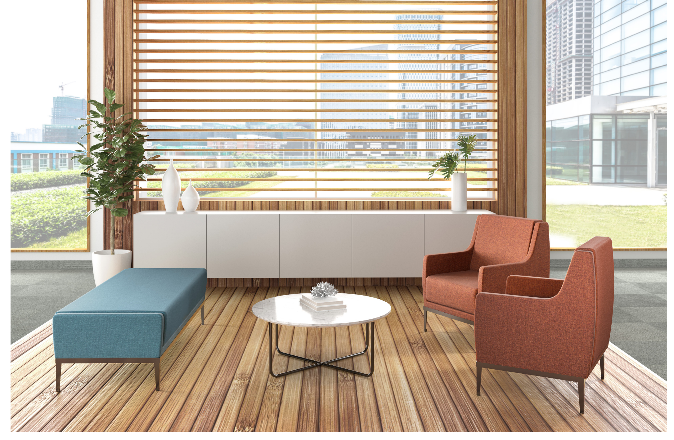
Leo Lounge + Compass Occasional