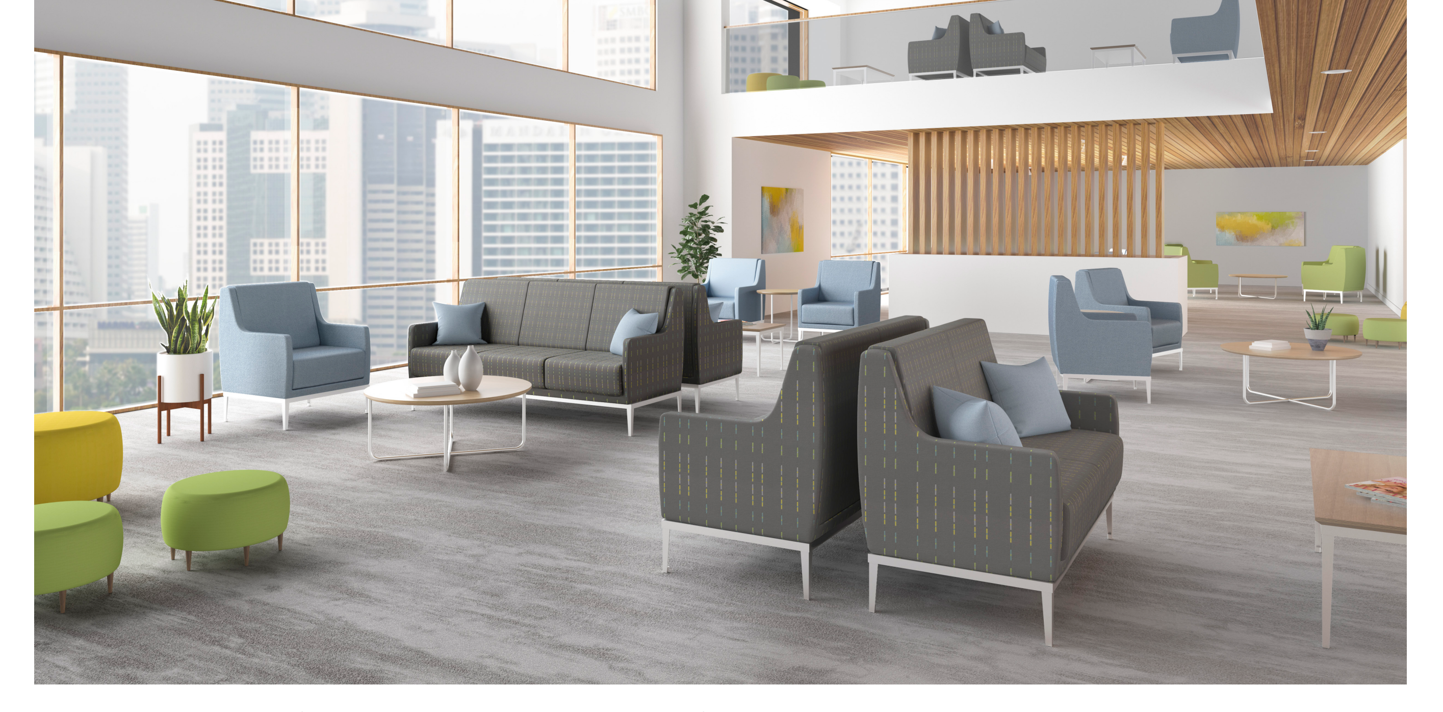
Leo Lounge + Occasional, 360 Ottomans, Compass Occasional